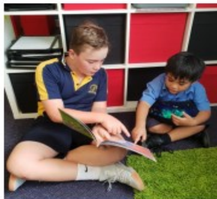
Time with our special Buddies