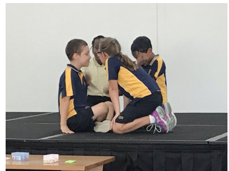
Year 5 3D statues of drinking containers