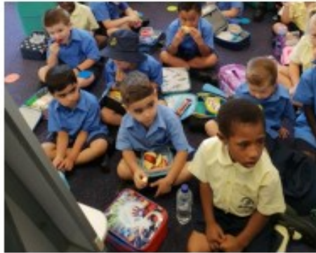
Crunch and Sip