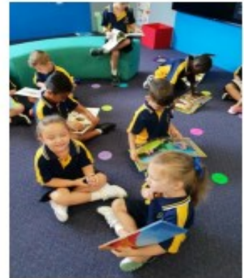
Reading books with our friends