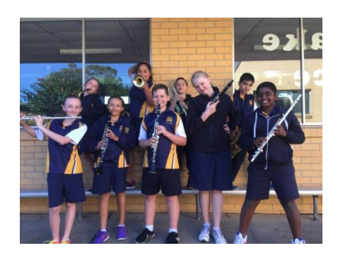
Captivate Primary Band