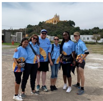
The Church of Our Lady of Remedies

Prior to spending a week in Panama for World Youth Day, our Parramatta group went to Mexico, including Mexico City and Puebla. We visited grand churches and basilicas, including the Church of Our Lady of Remedies, atop the largest pyramid in the world, and the Church of Santo Domingo. We experienced a festival hosted by the local Diocese in Puebla and visited the Pyramids of the Sun and Moon, climbing to the top of the Pyramid of the Sun!