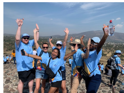
We made it!

Prior to spending a week in Panama for World Youth Day, our Parramatta group went to Mexico, including Mexico City and Puebla. We visited grand churches and basilicas, including the Church of Our Lady of Remedies, atop the largest pyramid in the world, and the Church of Santo Domingo. We experienced a festival hosted by the local Diocese in Puebla and visited the Pyramids of the Sun and Moon, climbing to the top of the Pyramid of the Sun!